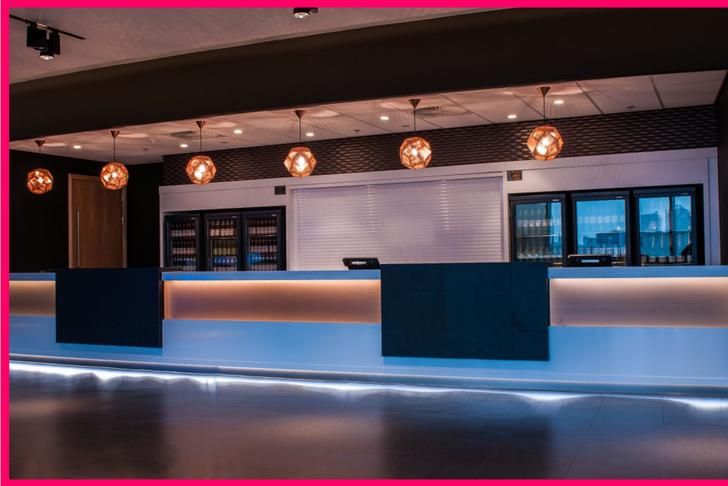
VIP Bar at Arena Birmingham - constructed from Corian solid surface, 3Form acrylic, Muraspec, black slate tiles and laminate.