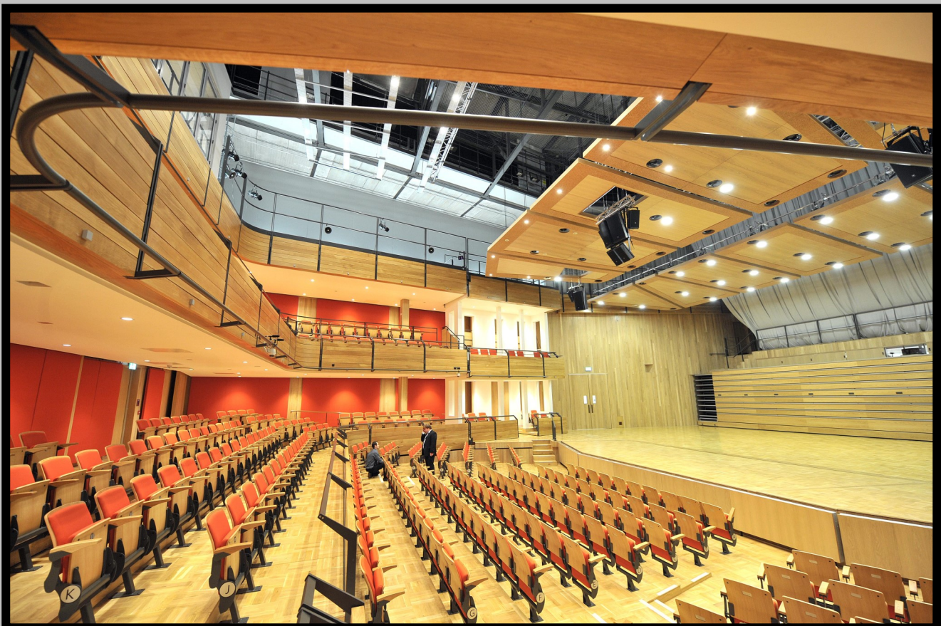
Bramall Music Hall, University of Birmingham - Solid oak panelling and doors, sliding red acoustic panels.