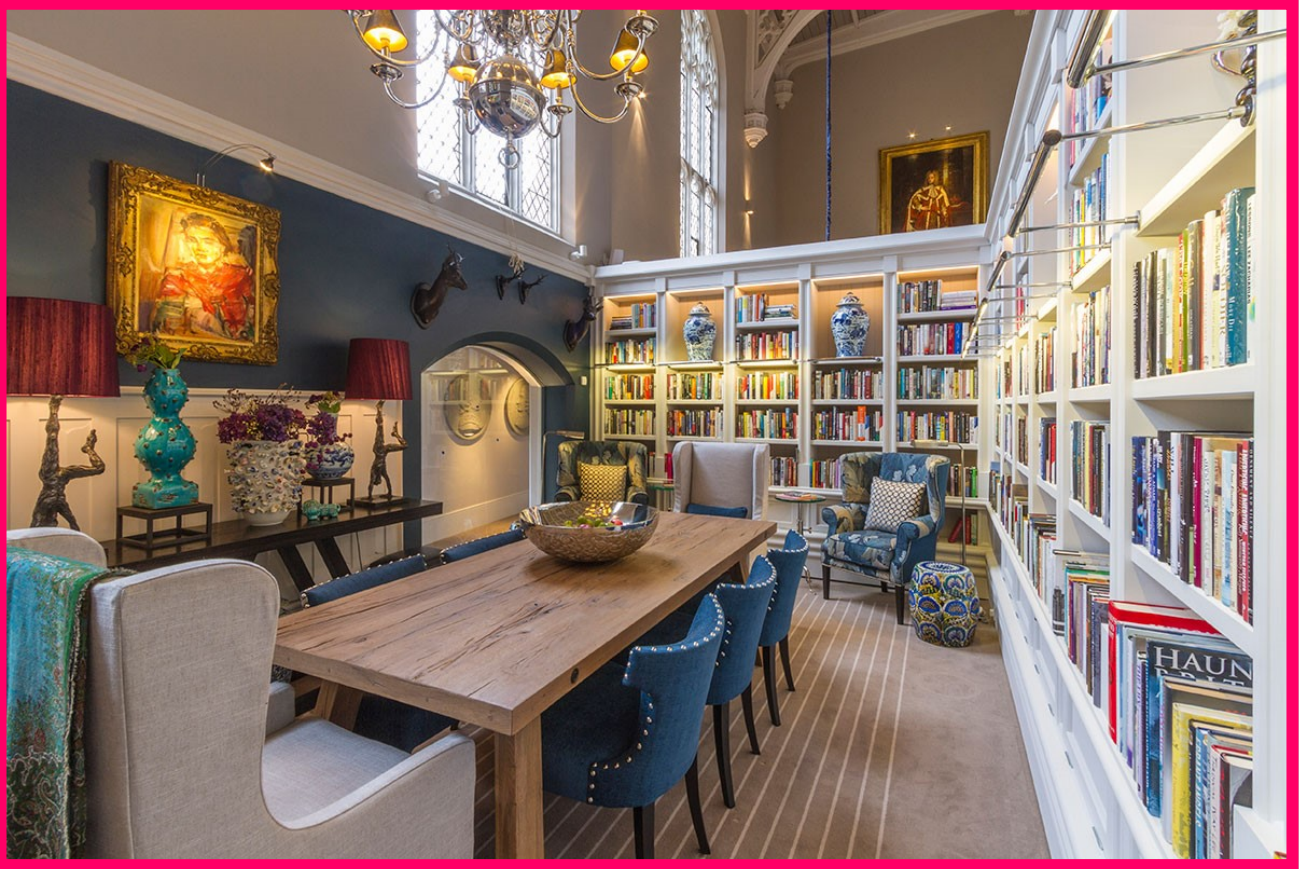
Binswood Retirement Village, Leamington Spa - Library furniture - MDF and solid timber library units with spray paint white finish