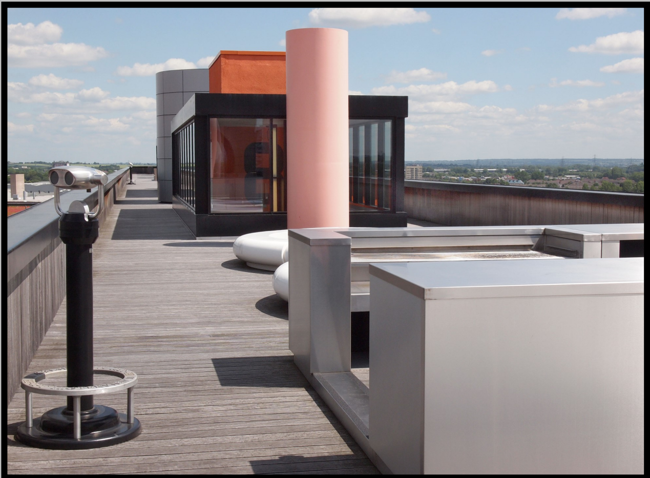
Fort Dunlop, Birmingham - Hardwood timber decking, balustrading and external staircases