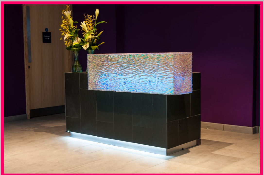
VIP entrance reception desk at Arena Birmingham. Desk built from ceramic black tiles and 3-form acrylic.