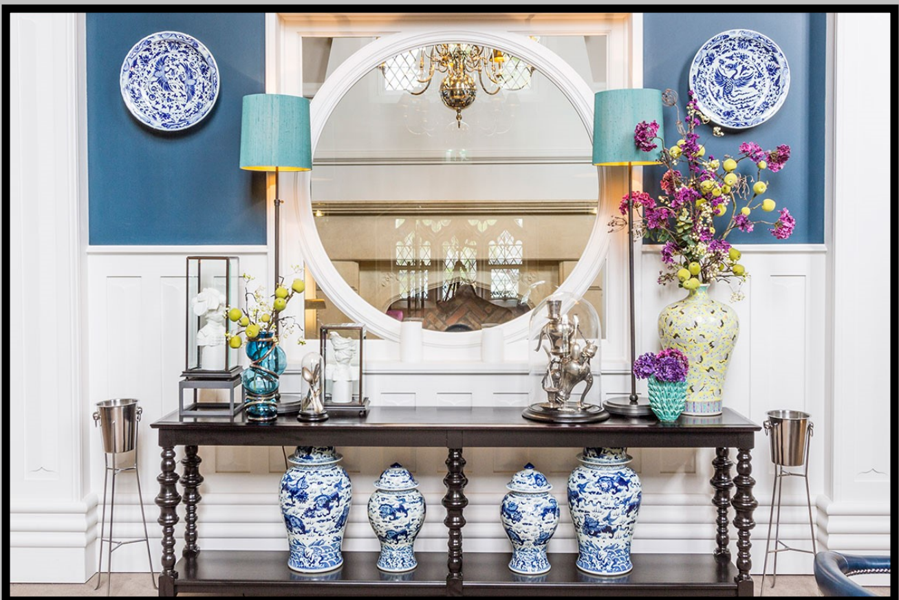
Binswood Retirement Village, Leamington Spa - Portal frame partition with linenfold panelling and radius window