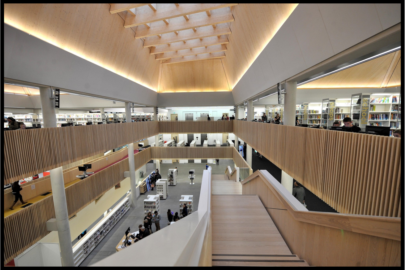
Worcester Library, The Hive - Solid ash staircase, handrail and acoustic panelling.