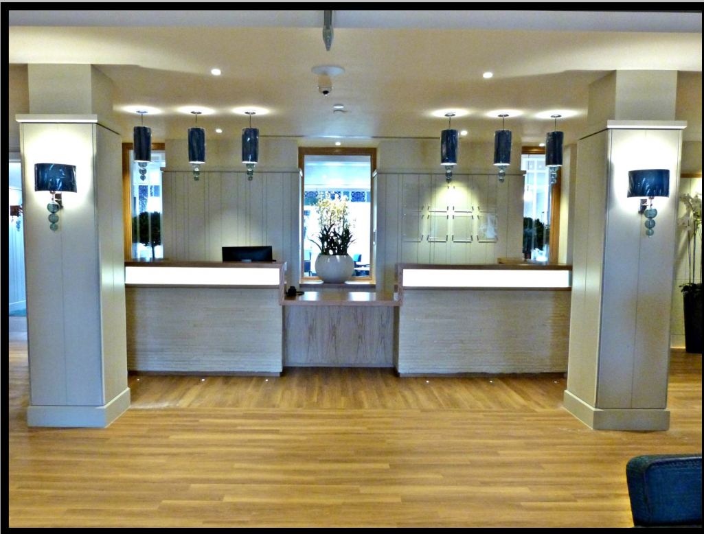
Reception desk at Richmond Retirement Village, Aston-on-Trent. Desk built from American white oak veneer, solid oak and limestone.