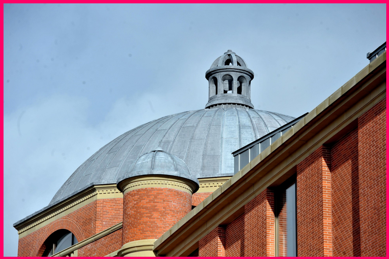
Bramall Music Building, University of Birmingham - Purpose built radius cupolas, finished with lead.