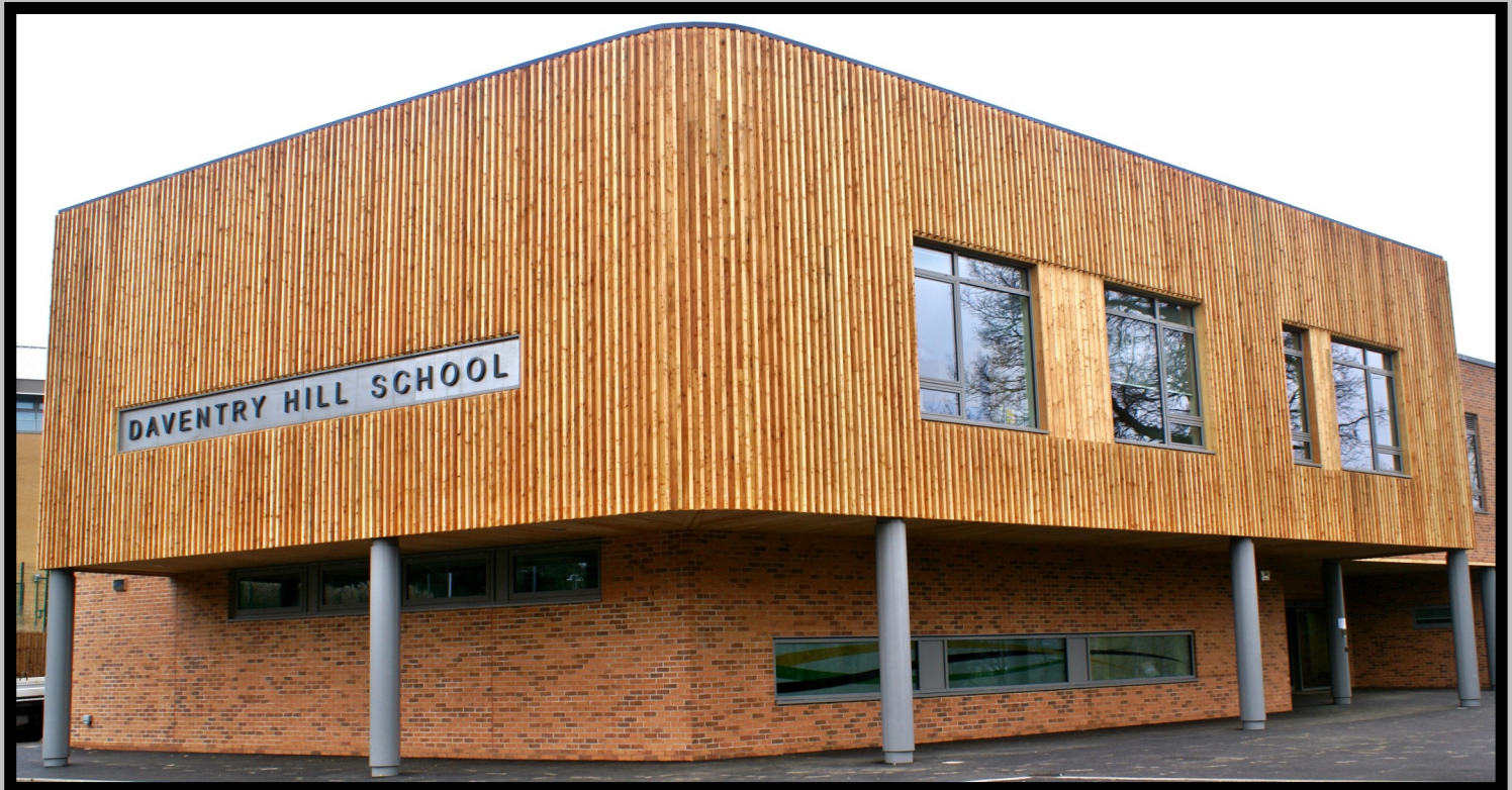
Daventry Hill School - External timber cladding