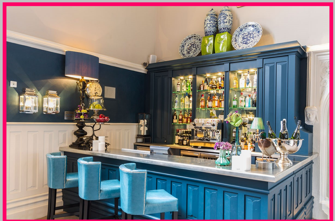
Main bar at Binswood Retirement Village, Leamington Spa - constructed from painted linenfold panels, pewter bar top and solid stone.