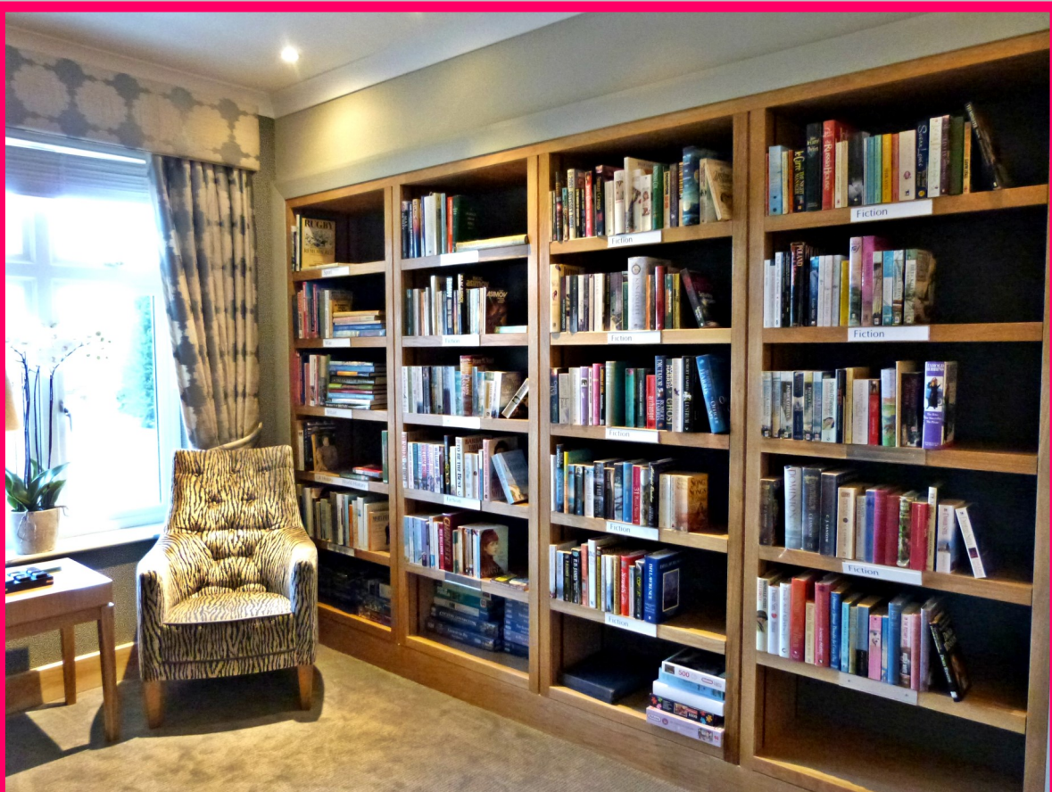
Richmond Retirement Village, Aston-on-Trent - Veneered and solid oak library furniture