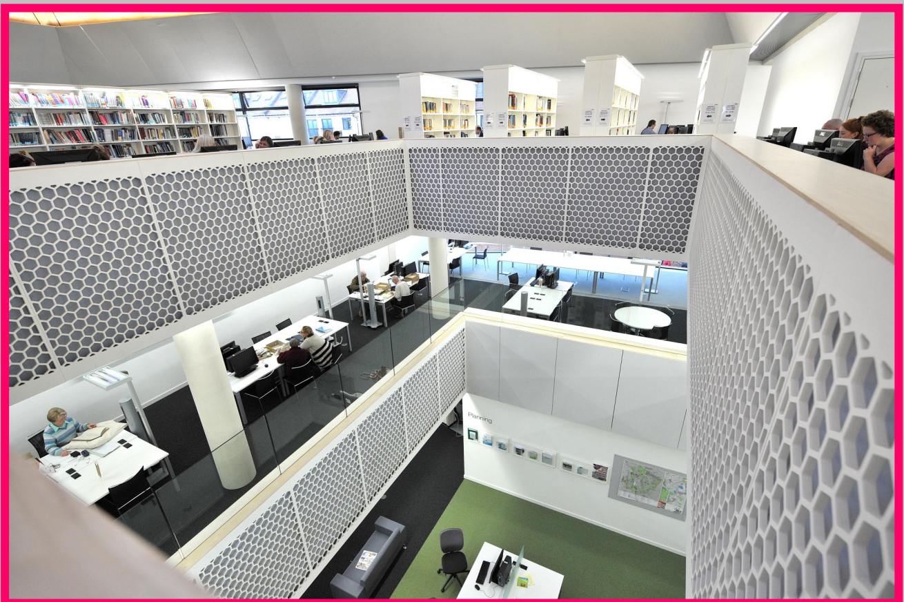
Honeycomb CNC cut MDF acoustic panelling - spray painted white finish.