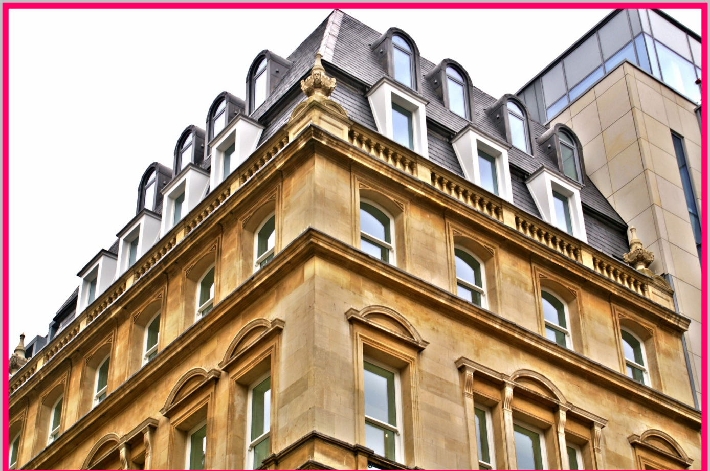
55 Colmore Row, Birmingham - External windows and dormer windows