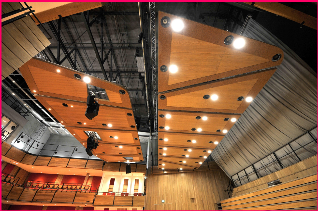
Bramall Music Hall, University of Birmingham - American white oak and cork acoustic ceiling rafts on rise and fall rig.