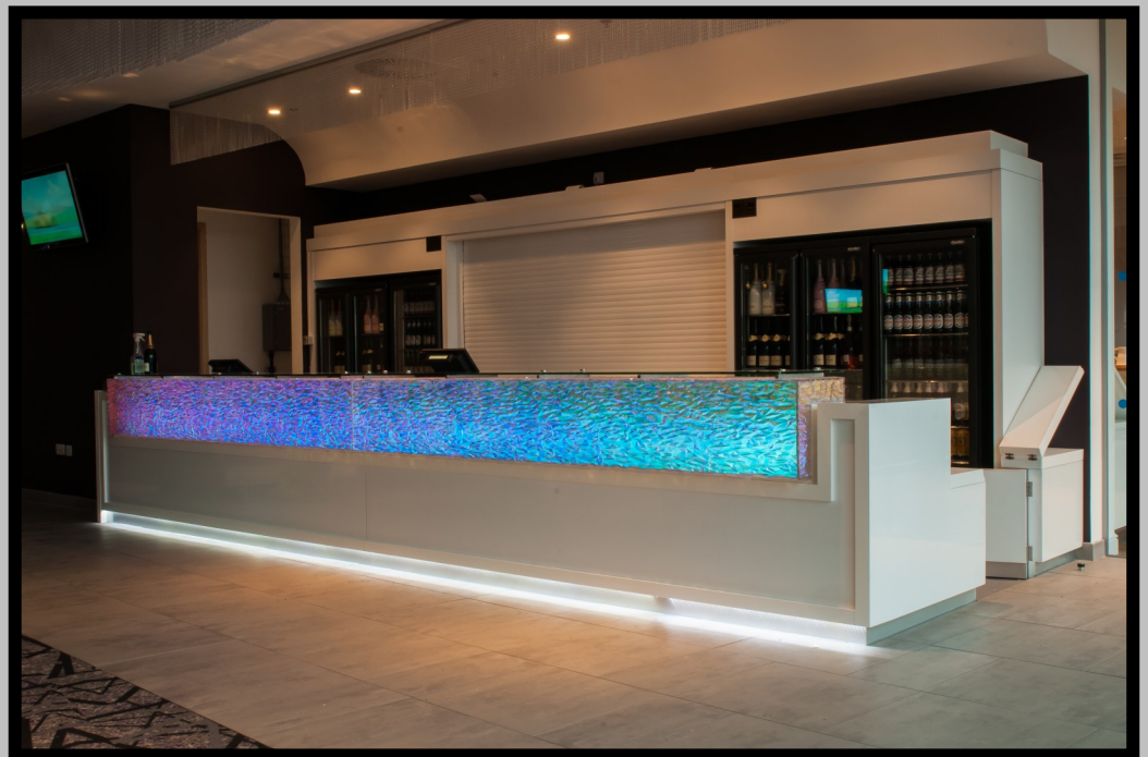
Sponsors Bar at Arena Birmingham - constructed from white laminate, solid surface Corian and 3Form acrylic.