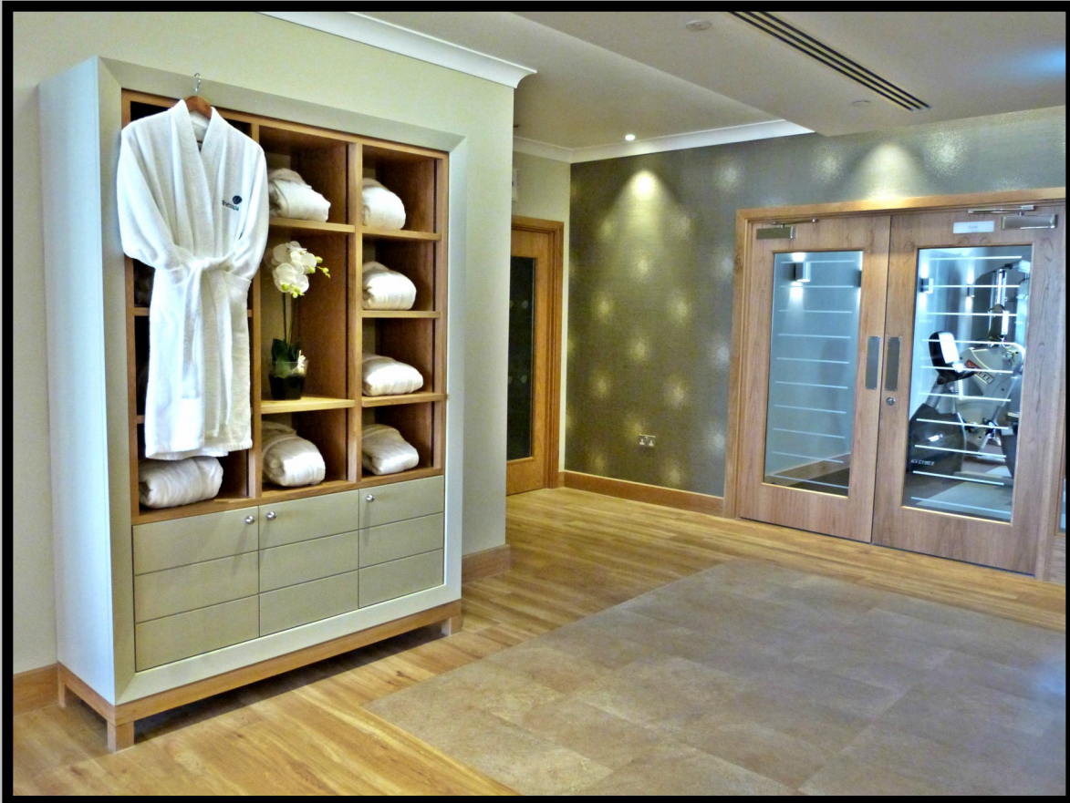
Richmond Retirement Village, Aston-on-Trent - Leisure spa storage unit - spray painted MDF and solid oak